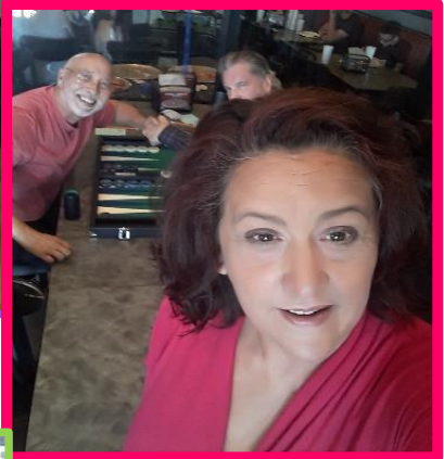
Photo Bomb The Final